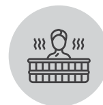
Steam and Sauna