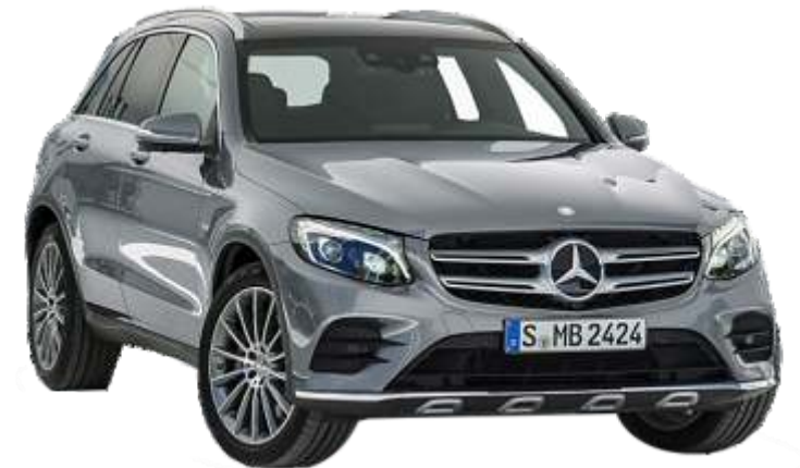
Mercedes Benz Car only one lucky customer