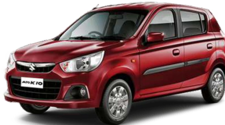
Alto Car Every 1 Year for lucky customers