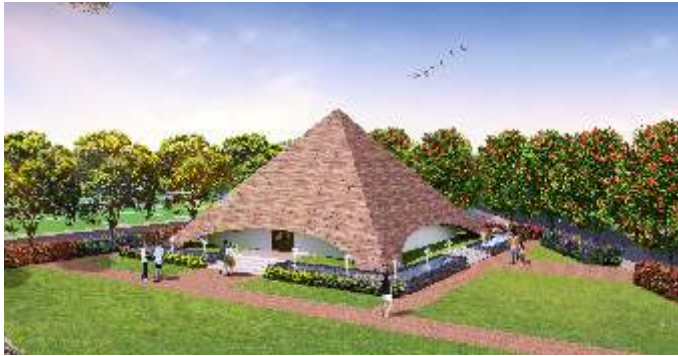
Pyramid Meditation Center

At Svamitva, we firmly believe in wholeness and togetherness. Accordingly, we shape landscapes to be completely incorporative of all that our clients would require, would need, would desire and dream of for their ideal habitation environment. The safe and serene expanse of this project has a sturdy, well-thought out entrance gate and generously spaced out units. We are working with Renowned landscape designers and architects from Pune and Bangalore.