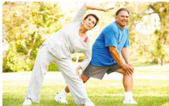
Nana Nani Park