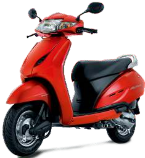
Honda Activa Every 3 months for lucky customers